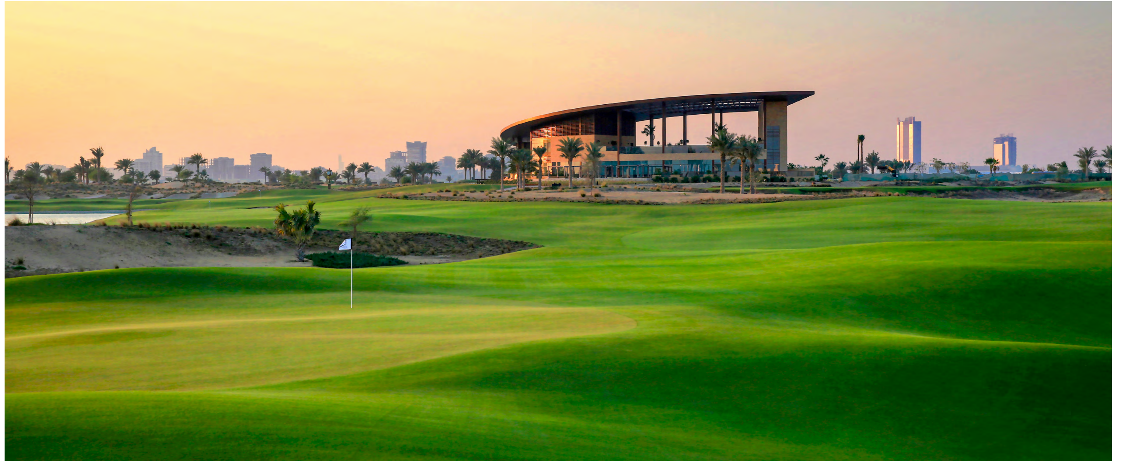
Trump International Golf Club Dubai